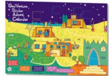
28 stickers to add

Pick one up before or after the 10.30 am service and start your Advent journey!