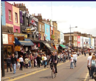
Sittingbourne, St Michael's Church

An 8 week course to grow our capacity to follow Jesus in the everyday